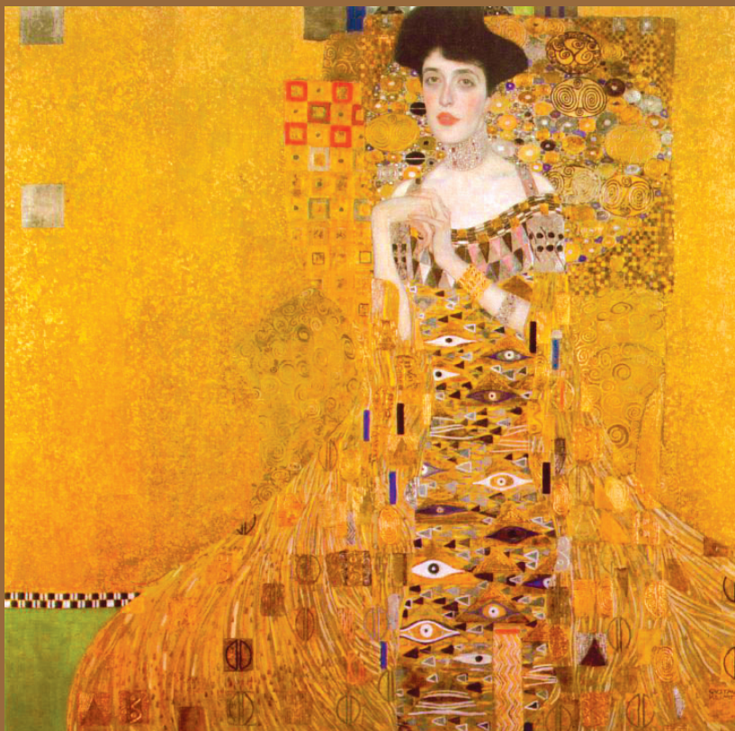
Portrait of Adele Bloch-Bauer I - (1907)